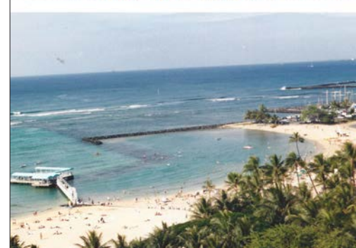
Ed and me in our favorite place, HAWAII and the view from our bedroom window.