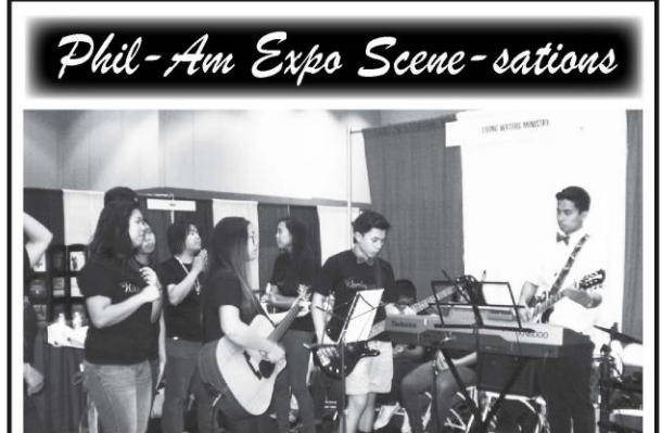
Phil-Am Expo Scene-sations The Living Waters R.O.C.K.s Worship Team is a group of young people who live to make the name of Jesus known. They are actively reaching out to bring light and truth to those in darkness and only wish to see His Kingdom come to life on Earth. Here they are rehearsing their songs while waiting for their number at the 28th Phil-Am Expo, Sept. 7 at the Los Angeles Convention Center.