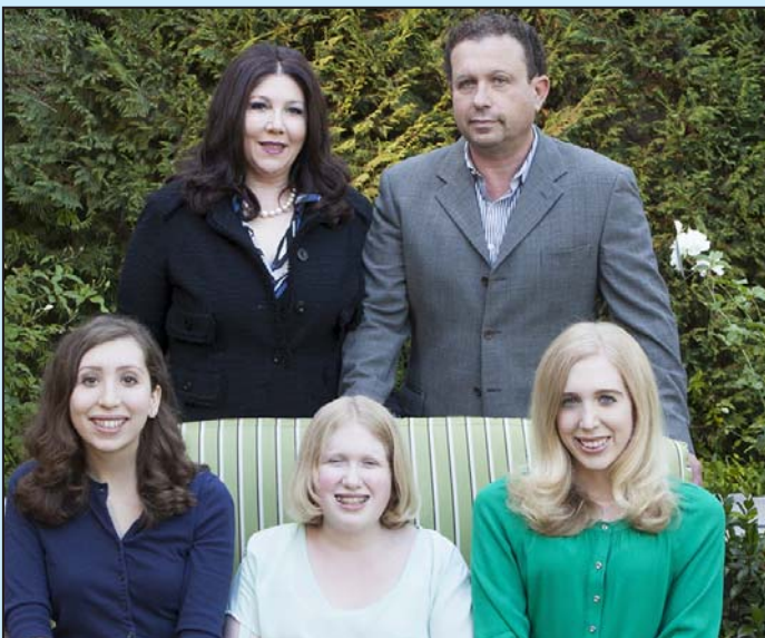
KORBATOV Page 3